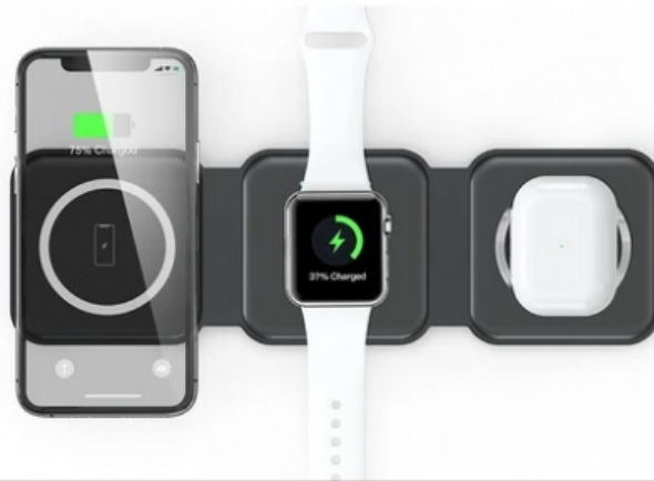
Regular Direct Charge